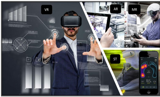
Figure 1. Extended Reality – umbrella term which includes the following technologies: